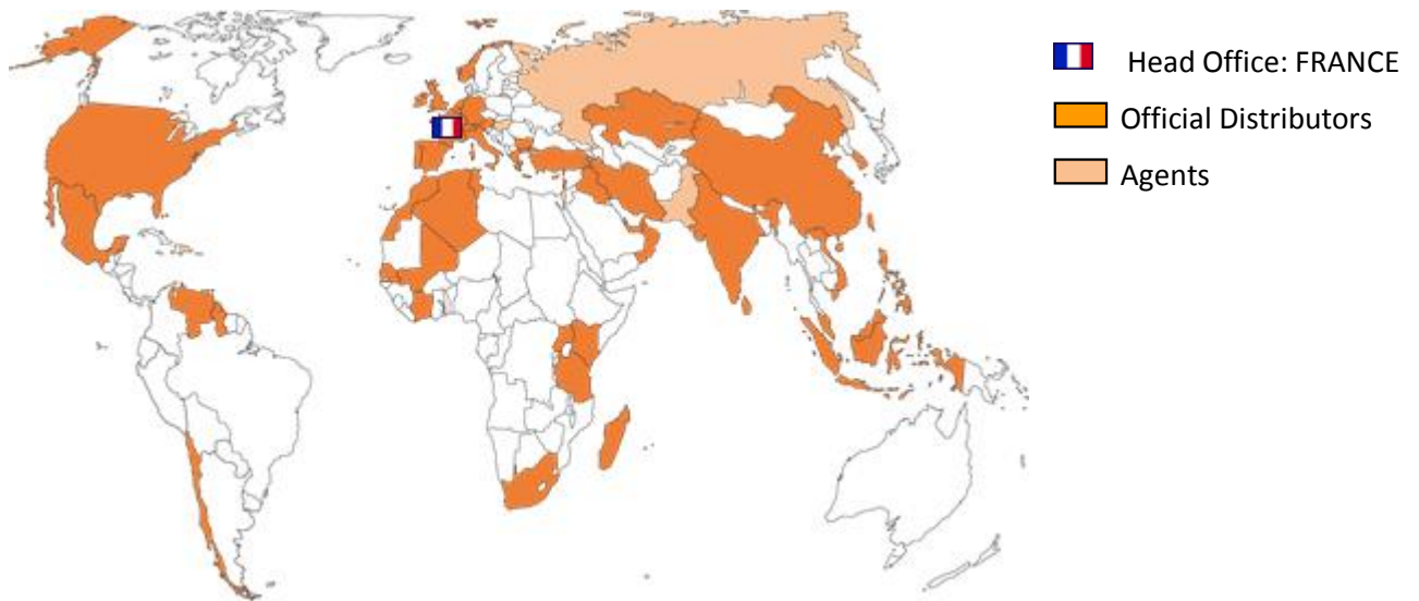
FIGURE 3 - CRE TECHNOLOGY DISTRIBUTORS

Check our entire distributors list around the world on www.cretechnology.com tab "DISTRIBUTORS"