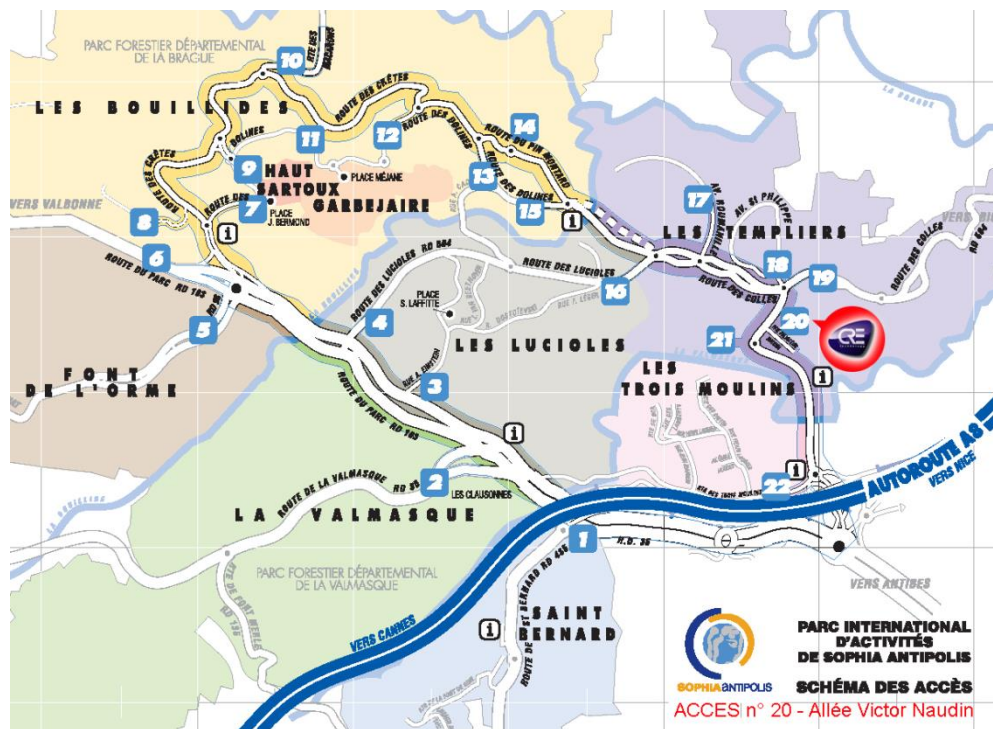
FIGURE 2 - ACCESS TO CRE TECHNOLOGY